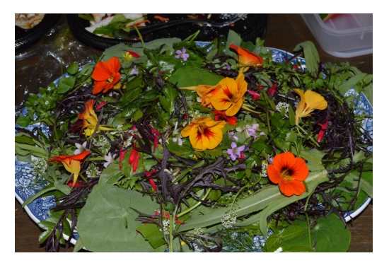
The salad plate is everything picked from the garden and was delicious.

Gardens attended as well. To top it off, everyone brought a plate to share for lunch, and a beautiful salad was picked from the garden to be enjoyed by all. Thanks again, Cathy, for sharing your time and space with us.